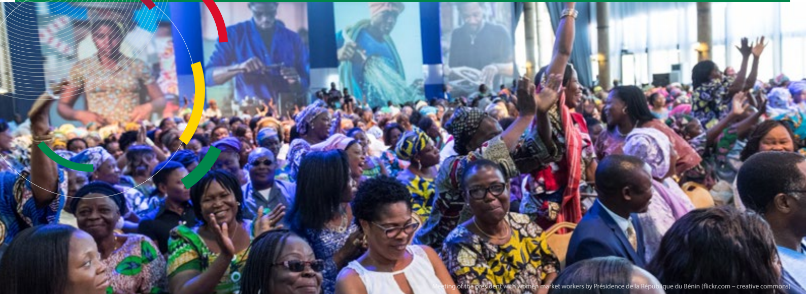
Meeting of the president with women market workers