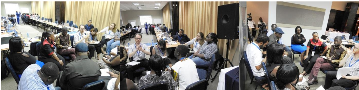
Conference participants engaged in serious group discussions