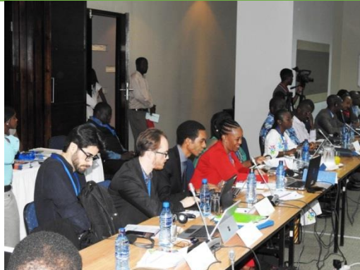
The Plenary in session